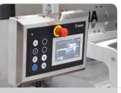
Electronic machine with Touch screen control panel